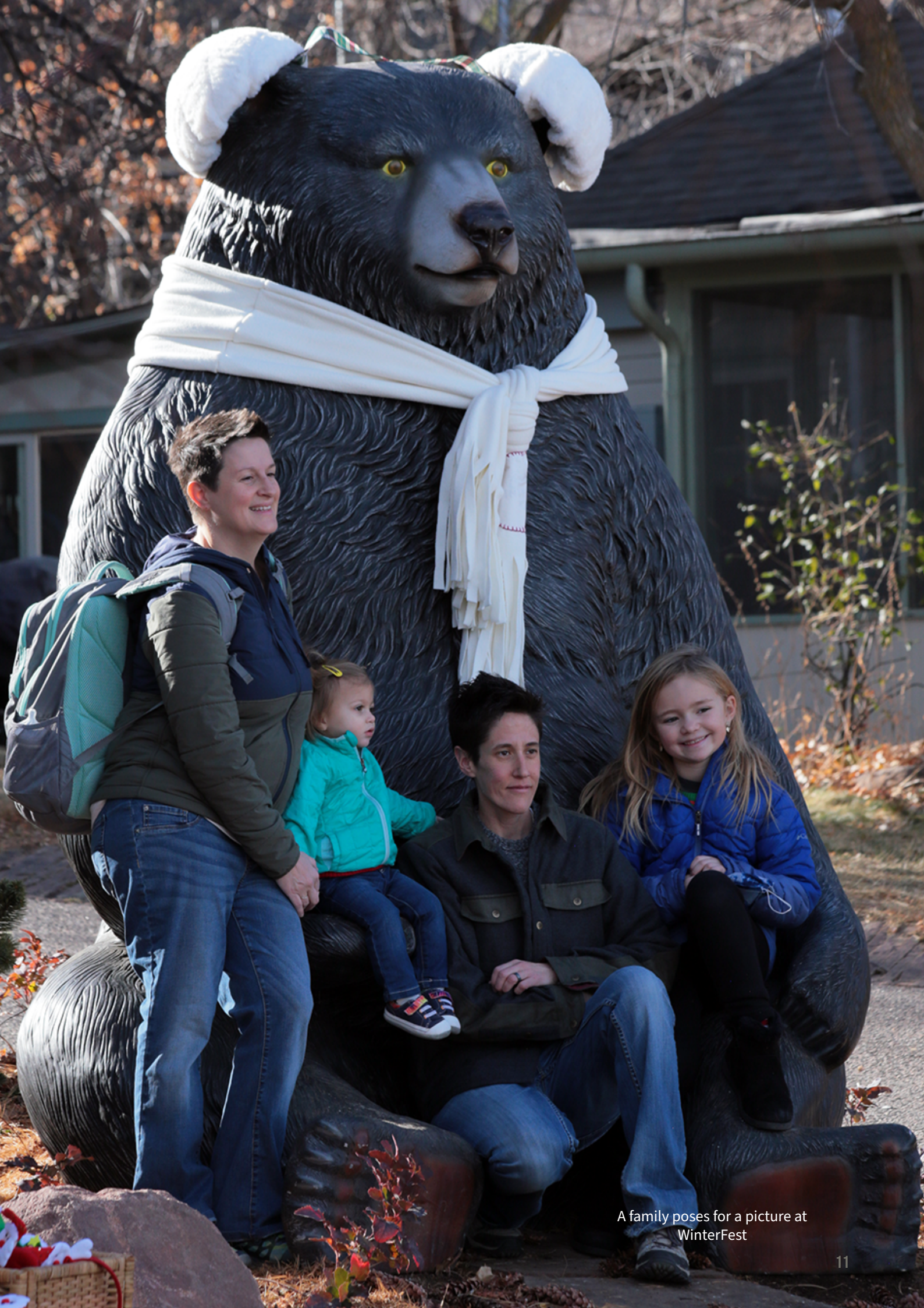
A family poses for a picture at WinterFest