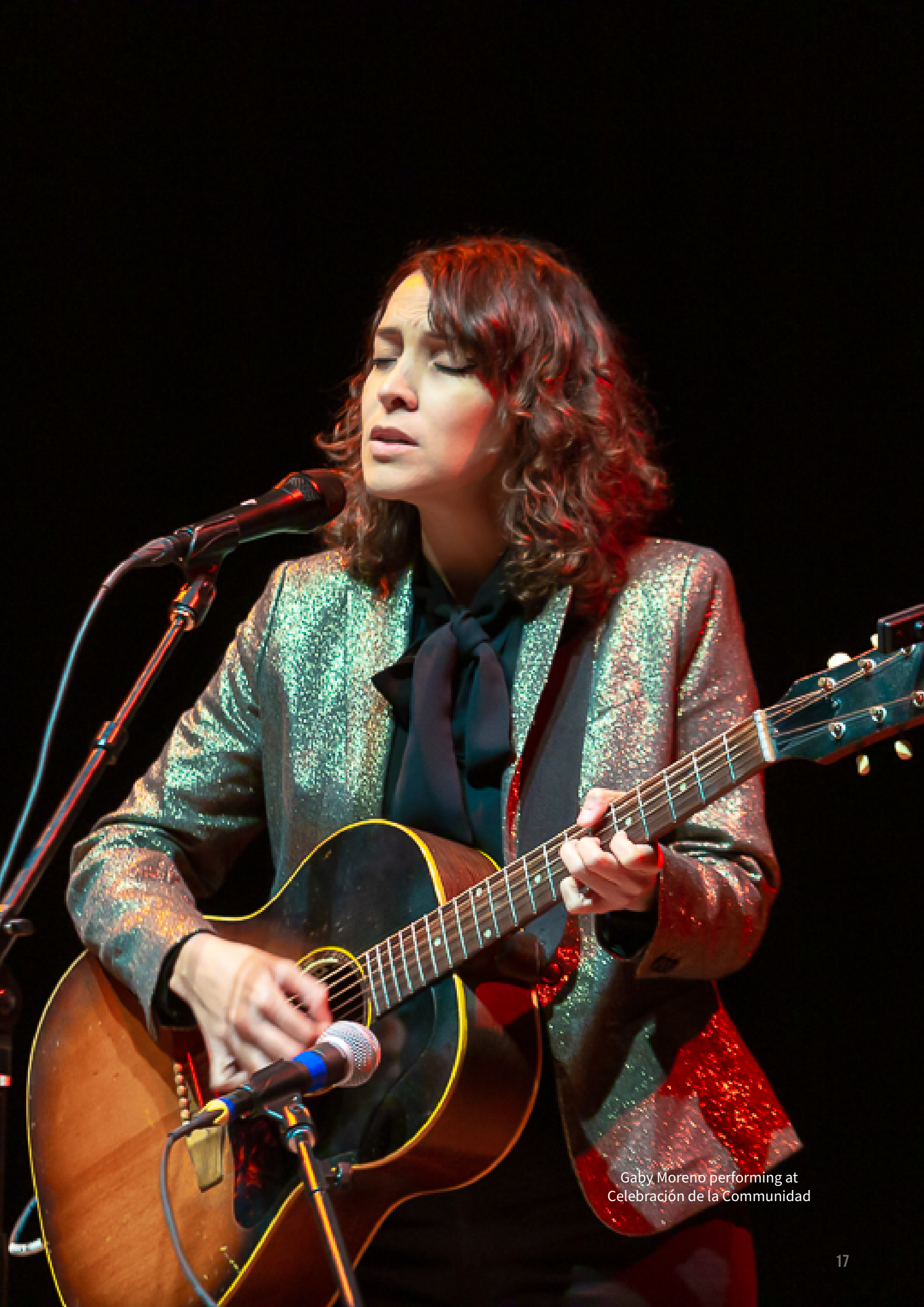
Gaby Moreno performing at Celebración de la Comunidad