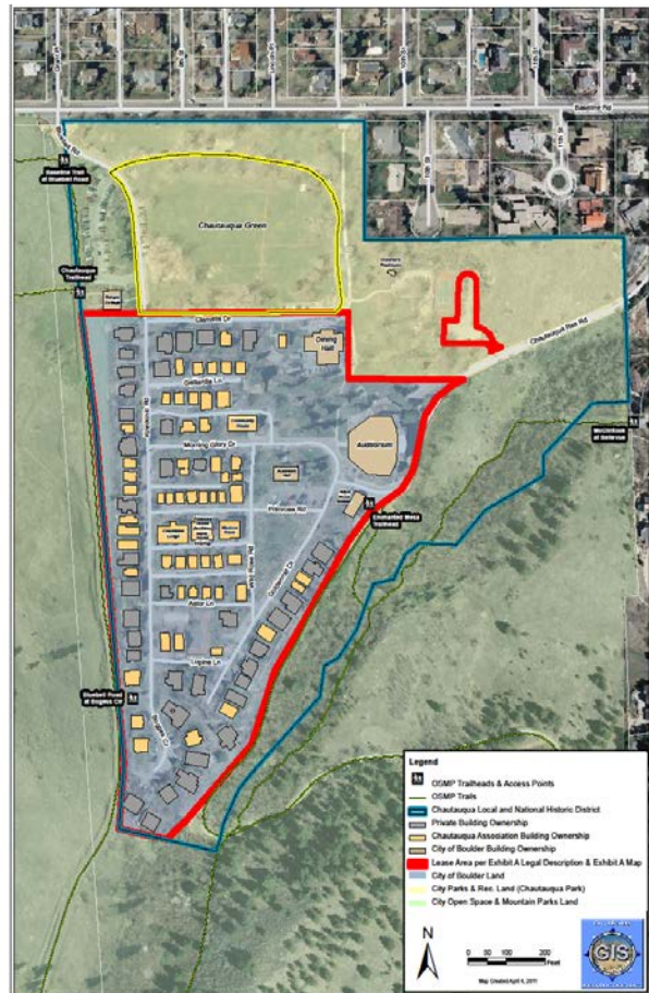
Figure 1: CCA Leasehold (outlined in red)

Place management: the process of preserving or enhancing an area in a manner that maintains its integrity as a “place” with a unique character and function. This is practiced through programs to enhance a location or to maintain an already attained desired standard of operation. Place management can be undertaken by private, public or voluntary organizations or a mixture of each. Despite the wide variety of place management initiatives, the underlying common factor is usually to best meet the needs of multiple users and interests (e.g., residents, visitors, and owners) in a manner consistent with the nature of the place.